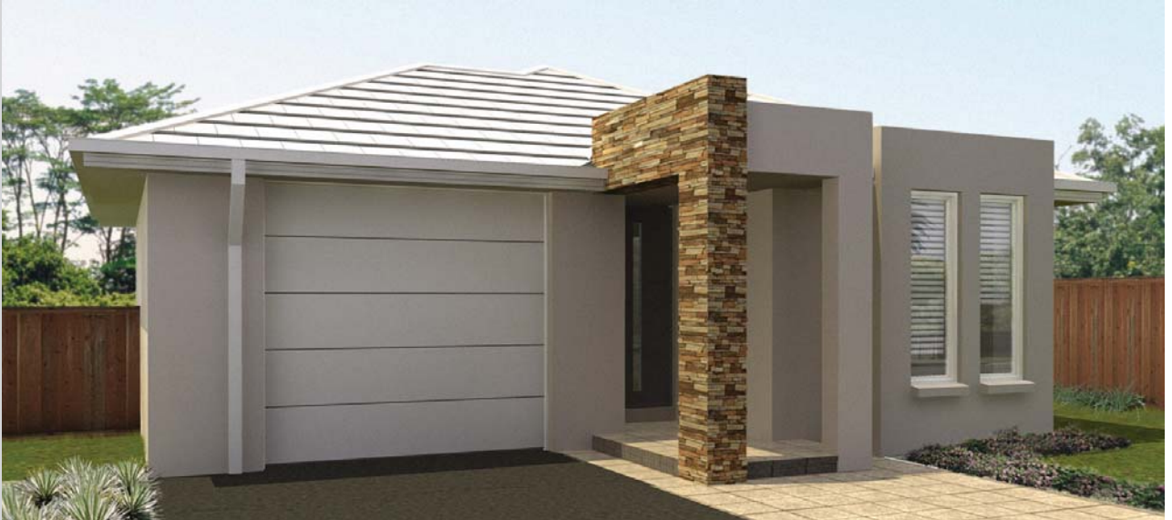
This illustration is an artist's impression only Concrete tile roof.